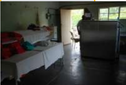
New Washing Machine and Ironing Machine

Delivery was not without incident. The machine was bought in Johannesburg and delivered to Harare. After it cleared customs etc, the hospital sent it's biggest truck from Chidamoyo to collect it, but it didn't fit. A bigger truck was hired. When it finally arrived everyone was so excited--even the doctor (in green scrubs) went to help unload! The picture shows Chidamoyo's human forklift - 10 men, carrying the machine into the laundry after a wall had been knocked out to accommodate it.