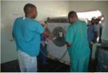
Machine Being Installed

The International Committee have assisted Chidamoyo Hospital in North Western Zimbabwe by contributing money to purchase an industrial washing machine that replaced stone sinks. Our contribution was $6,000. The total cost was apparently UK£9,800