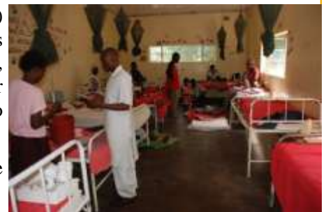
Childrens Ward Which is Planned to be Extended 100%

The Committee is intending to support the hospital in other projects later