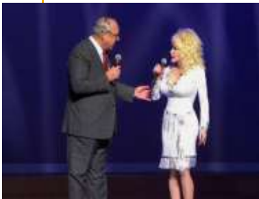
Country music legend and philanthropist Dolly Parton spoke at the RI Convention in Montreal about the importance of early childhood reading.

BOROONDARA OFFICE 3 Ingalls Road Canterbury Victoria 3126 Telephone 9279 4444 Facsimile 9279 4444 TTY 9279 4444 POSTAL ADDRESS Private Bag 1 Canterbury Victoria 3126