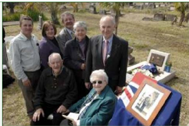
The Family at The Commemoration Ceremony